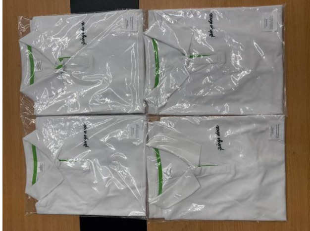
Folding view with poly back and front view

Buyer name: _____ Product: _____ Color: 04-March- 2025 As per PO